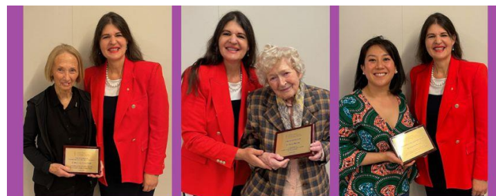
Congratulations AFMW President's Award Recipients